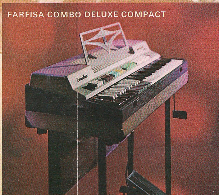
FARFISA COMBO DELUXE COMPACT