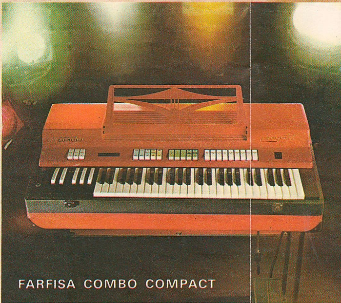
FARFISA COMBO COMPACT