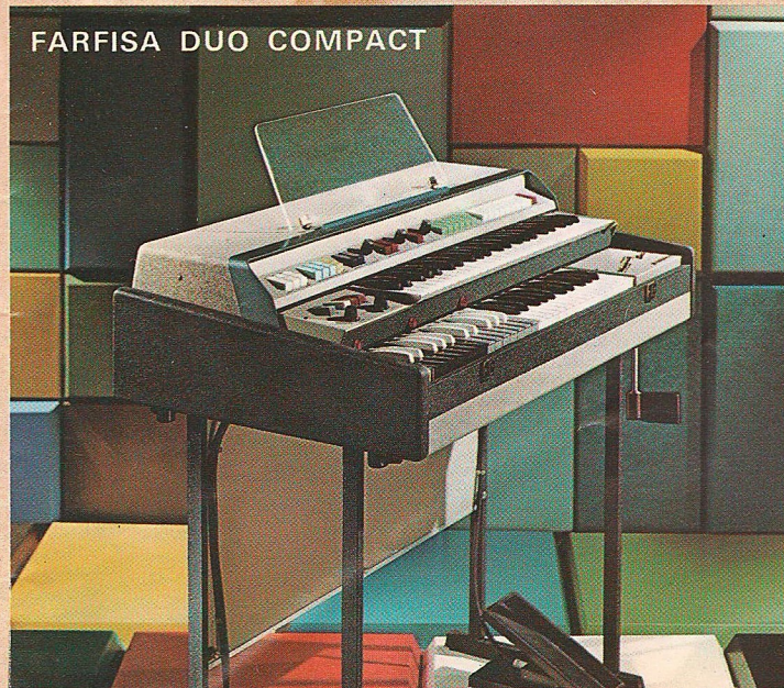
FARFISA DUO COMPACT

For best musical results, play the Duo Compact with the specially designed Farfisa Super 80. The Super Sabre, Sabre Reverb I and Farfisa BT 40 will also provide excellent results when played with the Compact Power Pak, which contains the pre-amplifier and reverberation system. With the Compact Power Pak, the Farfisa Duo Compact may be played through any amplifier.