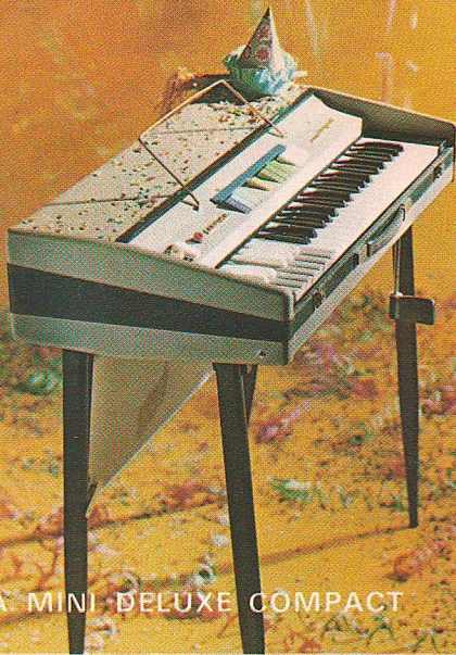
FARFISA MINI DELUXE COMPACT